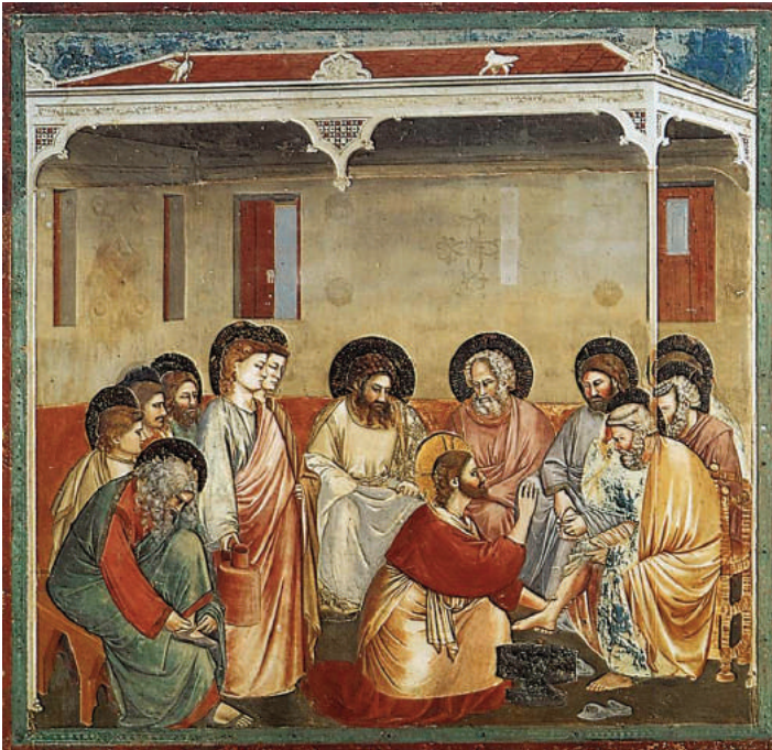
Washing of the Feet, Giotto, Scrovegni Chapel

O God, who in creating the human race willed that man and wife should be one, join, we pray, in a bond of inseparable love these your servants who are to be united in the covenant of Marriage, so that, as you make their love fruitful, they may become, by your grace, witnesses to charity itself.